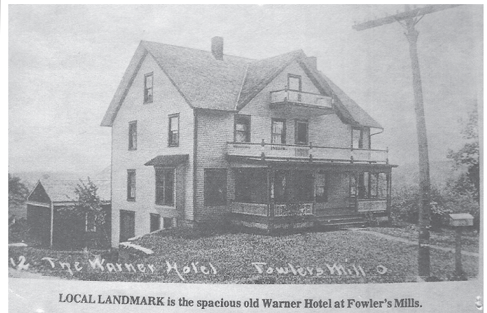
LOCAL LANDMARK is the spacious old Warner Hotel at Fowler's Mills.

Spring is upon us! As you may have noticed, the renovation of Town Hall was completed on time and under budget. Please come and see the benefit of everyone's hard work. The Township will be having an OPEN HOUSE on MAY 17 from 9am – 2pm . Come tour the building, enjoy some refreshments, learn about each of our departments, and take a peek in our new ambulance and truck. A highlight of the event will be the opportunity to obtain free health screenings from 9am - Noon (for those 18 years or older), courtesy of The Cleveland Clinic, in connection with our Healthy Munson initiative. The free screenings can include total cholesterol, blood sugar, blood pressure & body mass index screenings for any Munson resident, employee or member of a Munson organization, church or business. Healthy Munson will feature an event each quarter that will provide the opportunity to get outside or do something to benefit your mind and spirit. If you sign up for screenings, we will send you home with a pedometer, water bottle and information to help you on your journey to better health. We hope to see you on May 17th!