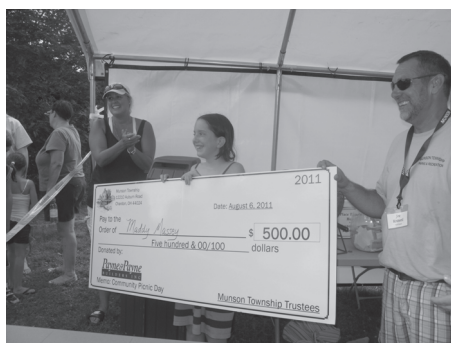
Our grand prize winner!

A $1,000 donation from Fairmount Minerals (Best Sand) and proceeds from the dunk tank, raffles, silent auction, and four pay-to-play games raised over $5,200 for the Scholarship Fund.